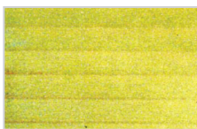
Polycarbonate Panels After 1000 Hours